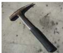
Geologist or Prospector's Hammer

The geologist or rock hound has several different rock hammers to choose from. Usually just one is enough for a day trip—the right one. Suitable hammers can be found in most large hardware stores, although they may not be labeled as rock hammers. They are fine starter hammers and for many users are all they need for a lifetime. Hammers of higher quality and different designs are available from specialty manufacturers and dealers. Heavy users, people with unusual physiques, rock hounds who want a wide choice of options and someone looking for a special present should seek these out, but most people don't need a premium tool. The important thing is to avoid cheap, off-brand tools from discount stores. These can be made of brittle, soft or poorly tempered metal that may splinter or bend in heavy use, endangering the user and anyone standing nearby. And cheap materials in the handle may cause strain to the arm and wrist, perform poorly when wet or turn crumbly after long sun exposure.