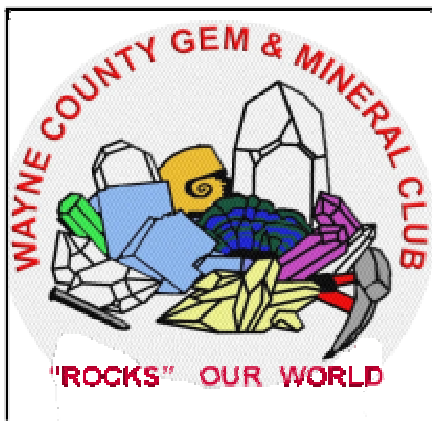
WCG&M CLUB Present New Patches!