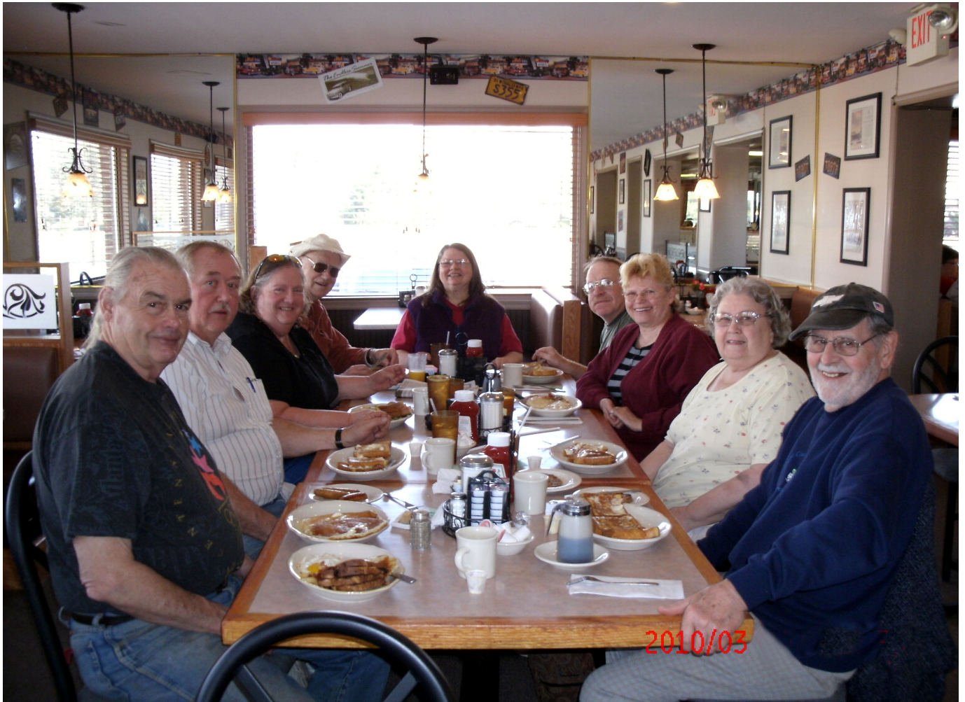
Good Eats at the Carlisle Diner!!