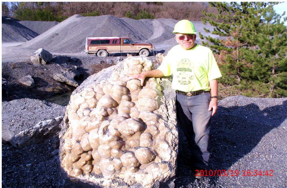
No Bill. You can't take it home.