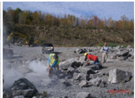
They came from Boston & points beyond.