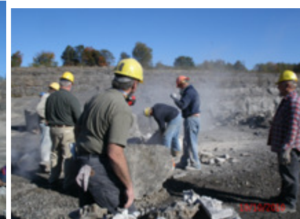
State Job – 1 guy working 5 watching