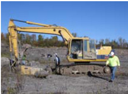
Dolomite's new Rock Buster