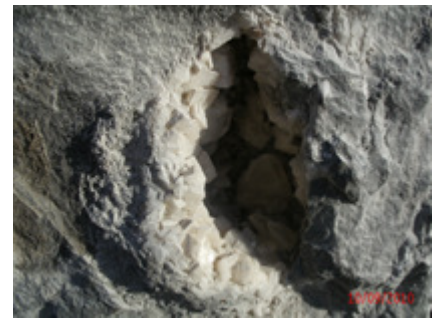
Dolomite in Dolostone