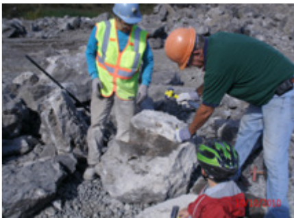
Capital District area folks