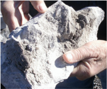
Fluorite cubes just cut out