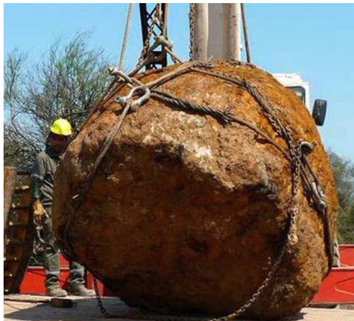
The Argentina meteorite has been named Canceledo, after the closest town to its discovery location.

A 30,800-kilogram meteorite unearthed in Argentina in 2016 is purported to be the second largest meteorite ever found on earth. The iron-nickel meteorite was uncovered in Campo del Cielo (meaning "Field of Heaven") in an area on the border between the provinces of Chaco and Santiago del Estero, or about 1000 km northwest of Buenos Aires..