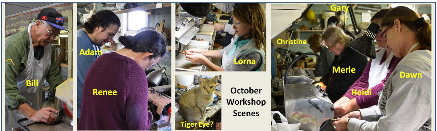
October Workshop Scenes

Registration is required. Visit Penfieldrec.org