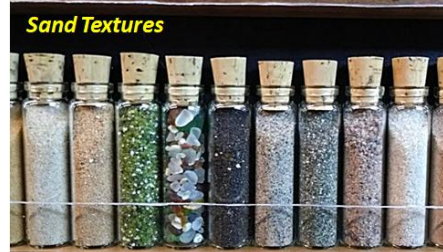
SAND – (see page 3)