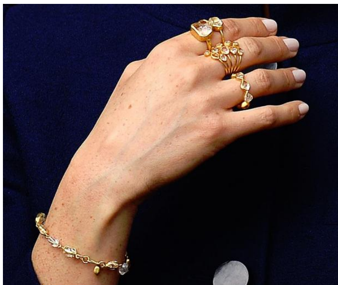
Some of Meghan Markle's royal wedding Herkimer jewelry.

One of our favorite mineral collecting haunts received international attention this past month. It happened on October 12 th at the royal wedding of Princess Eugenie at Windsor Castle. Meghan Markle, just five months after her wedding to Prince Harry, wore a new set of custom jewelry consisting solely of Herkimer "diamonds" set in 18 karat yellow gold. The ensemble included four rings, one bracelet, and a pair of earrings.