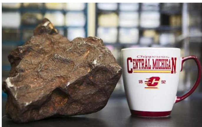
This 22-lb. (10 kilograms) meteorite is believed to have touched down in the 1930s.

A rock that was being used as a barn doorstep on a farm in Michigan is actually a massive meteorite worth over $100,000. The sixth largest meteorite recorded in Michigan has just been rediscovered.