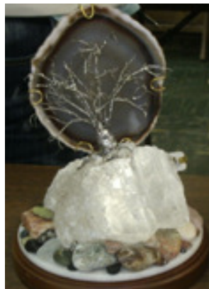
Never a dark moment