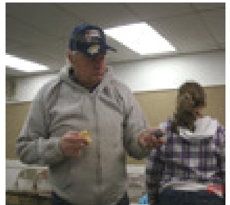
Be careful of which one you bite into