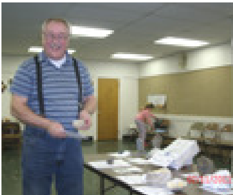
And the winner is .... Not me?