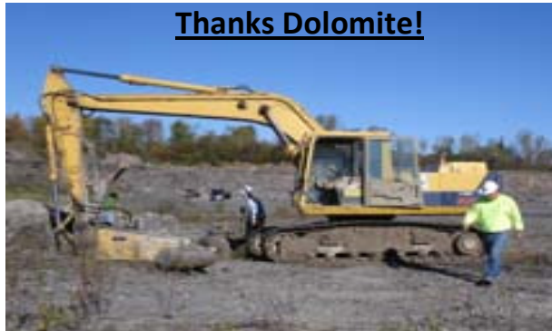
Dolomite's Rock Persuader